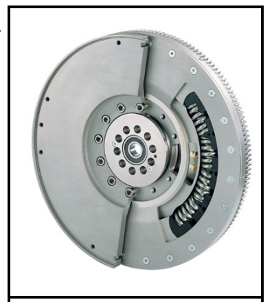
Dual Mass Flywheel (D16)

The amount of dampening that is achievable within a clutch assembly's disc design is restricted by the close-in positioning of its spring elements and axial packaging space limitations. Conversely, the DMF has its spring elements positioned near its radial extremities, which provides